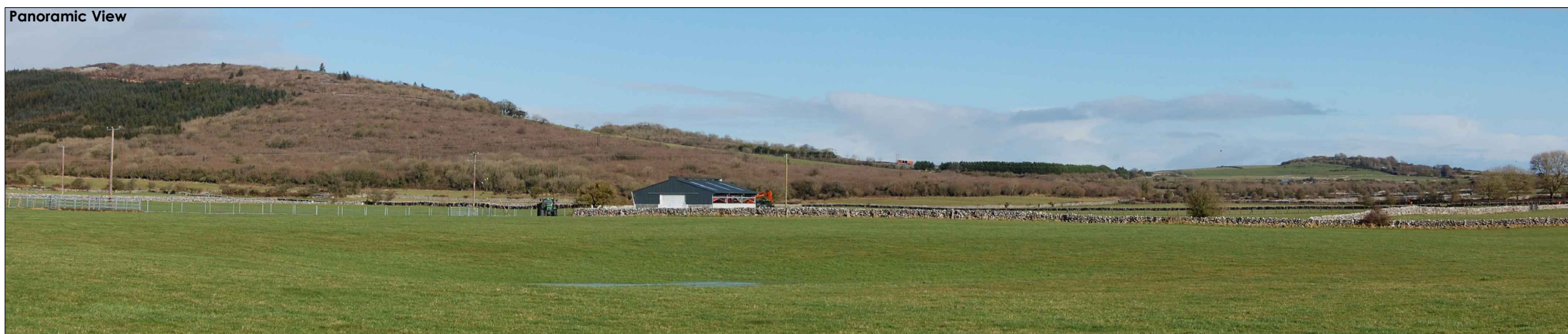
Viewpoint 4 Northeast from Carheens, Belclare.

View Northeast towards subject site from minor road adjacent to residential properties. Knockmaa Hill is a visual focal point. Operational areas of both quarries are not visible from this viewpoint however the incongruous Leylandii boundary hedging are clearly visible. There are no views relating to the unauthorised development works from this viewpoint.